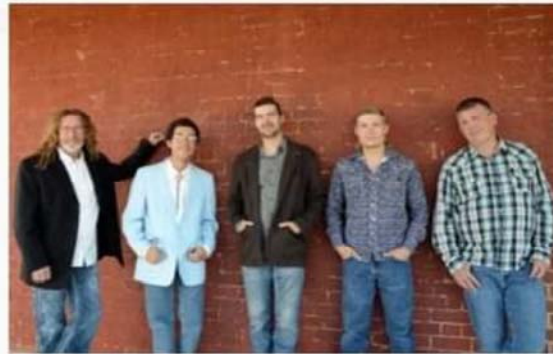
NOTHIN' FANCY ALL 3 DAYS